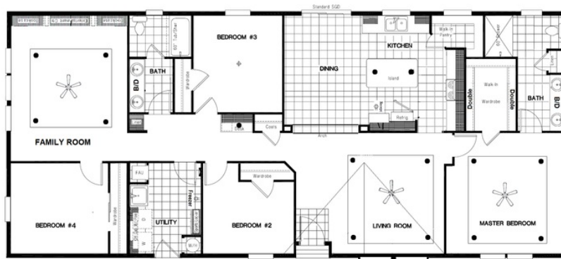
QUALITY LIVING FOUR BEDROOM, 2 BATH, LR / FAMILY ROOM, 2,040 SQ. FT.