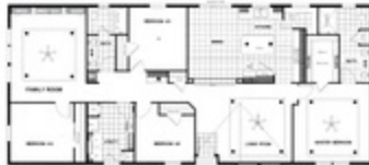
QUALITY LIVING FOUR BEDROOMS & MORE UP • AVAILABLE FROM 12/15/17 ON